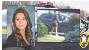
Update: Missing Stillwater 13-year-old found safe, state police say