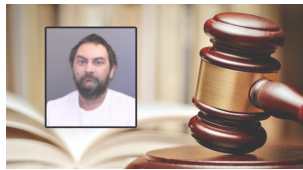
DA: Schenectady man sentenced to up to 20 years in child pornography possession case